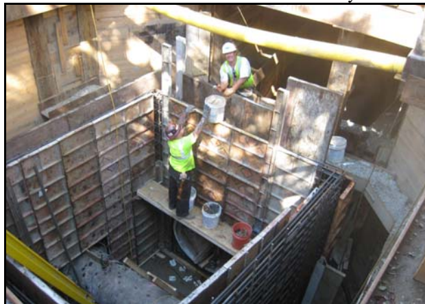
DEEP PIT at CARLTON/MONMOUTH intersection: Construction underway for Sewer Interceptor Structure #2