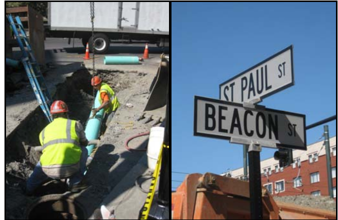
ST. PAUL STREET: Storm Drain Connection