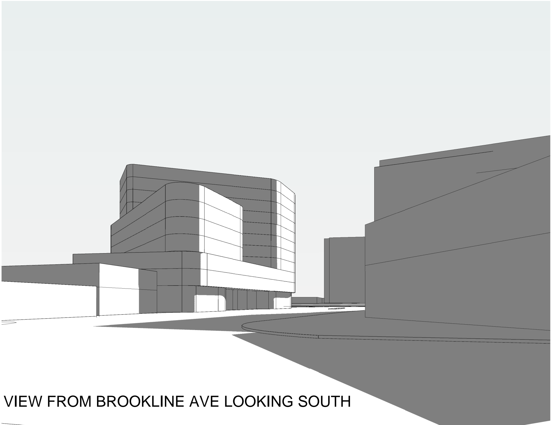
VIEW FROM BROOKLINE AVE LOOKING SOUTH