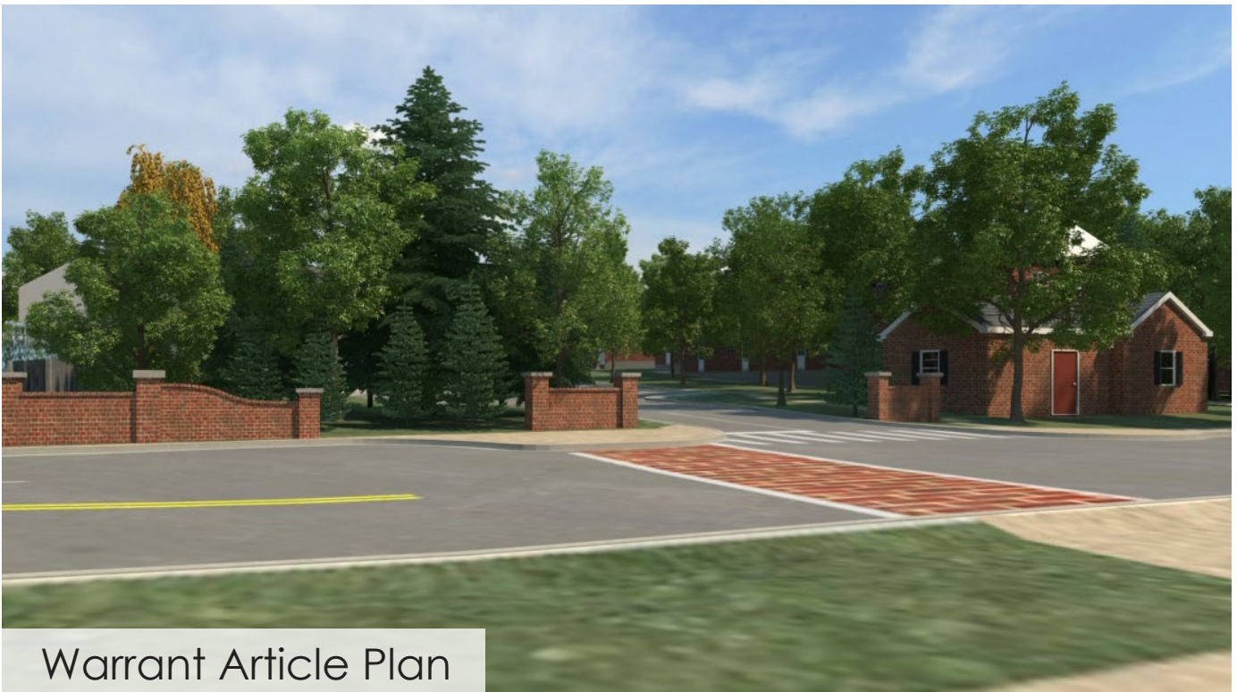
Warrant Article Plan