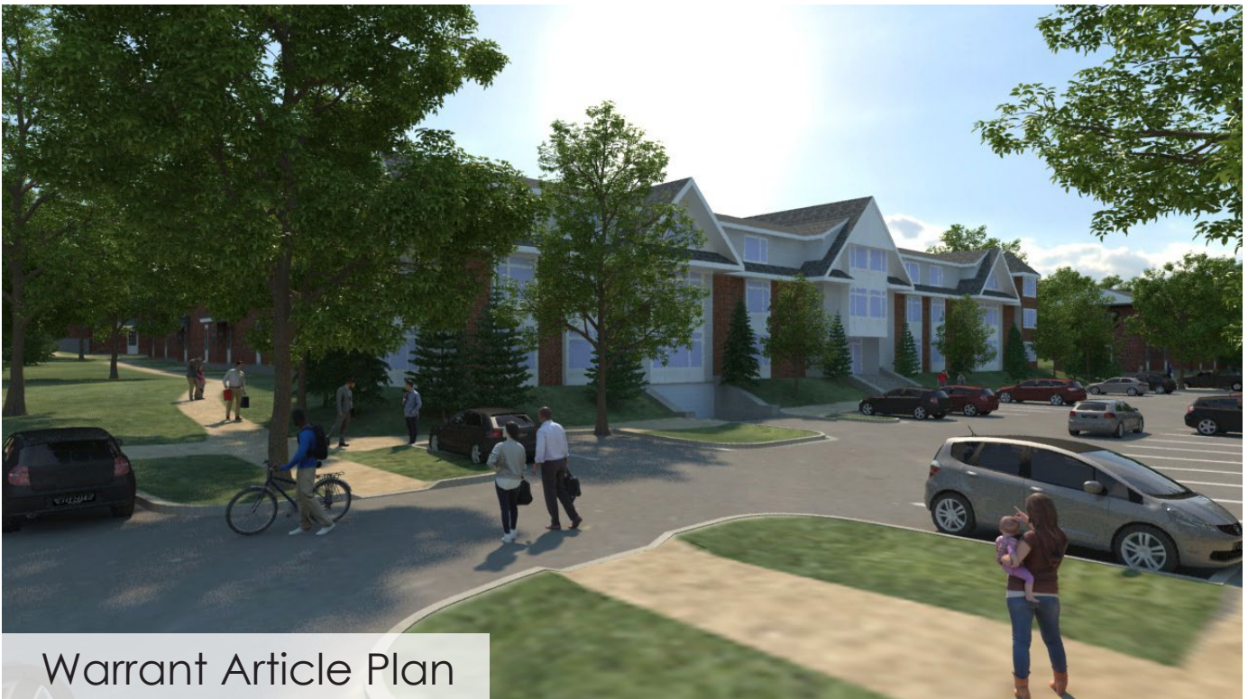
Warrant Article Plan