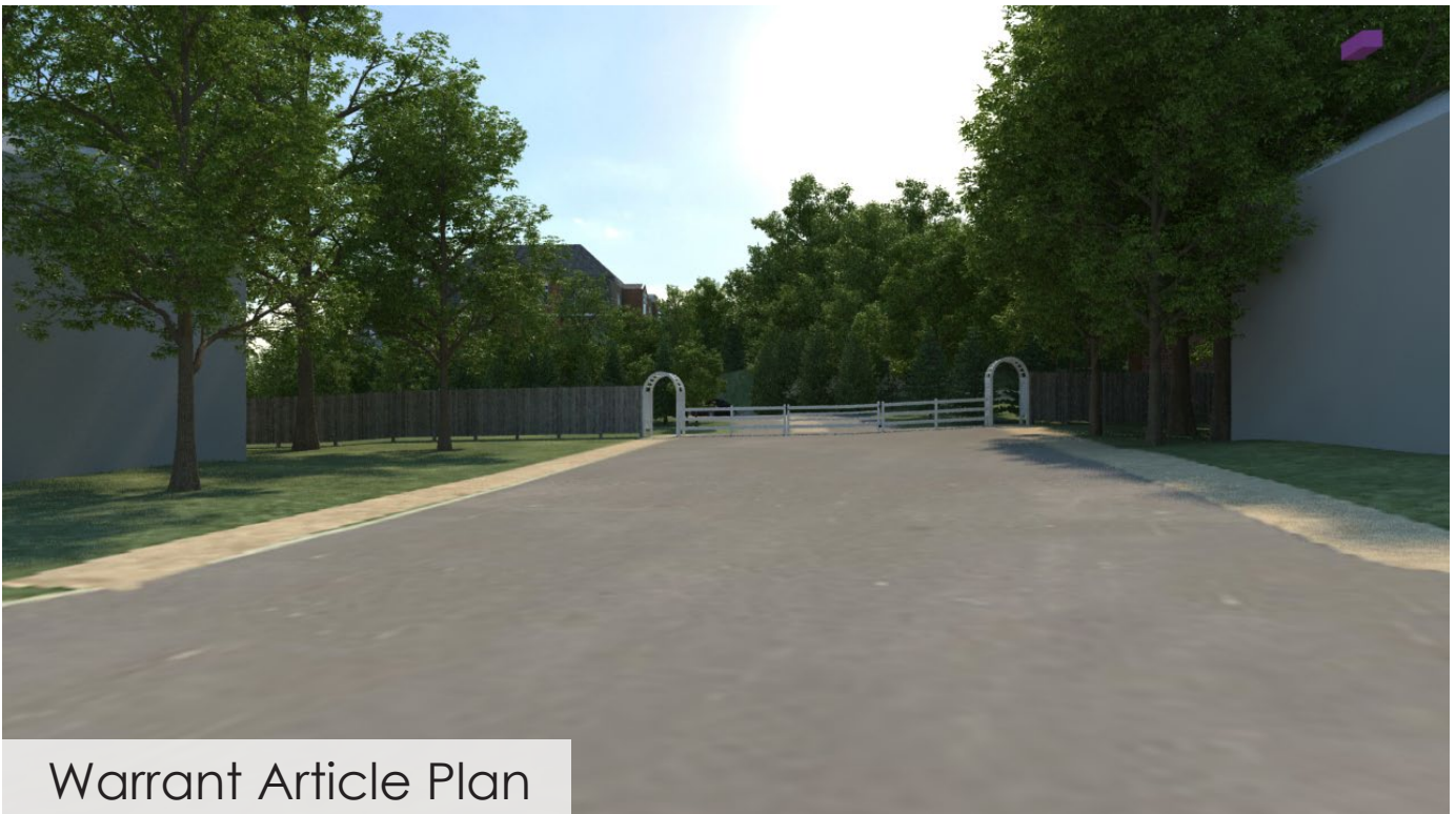
Warrant Article Plan