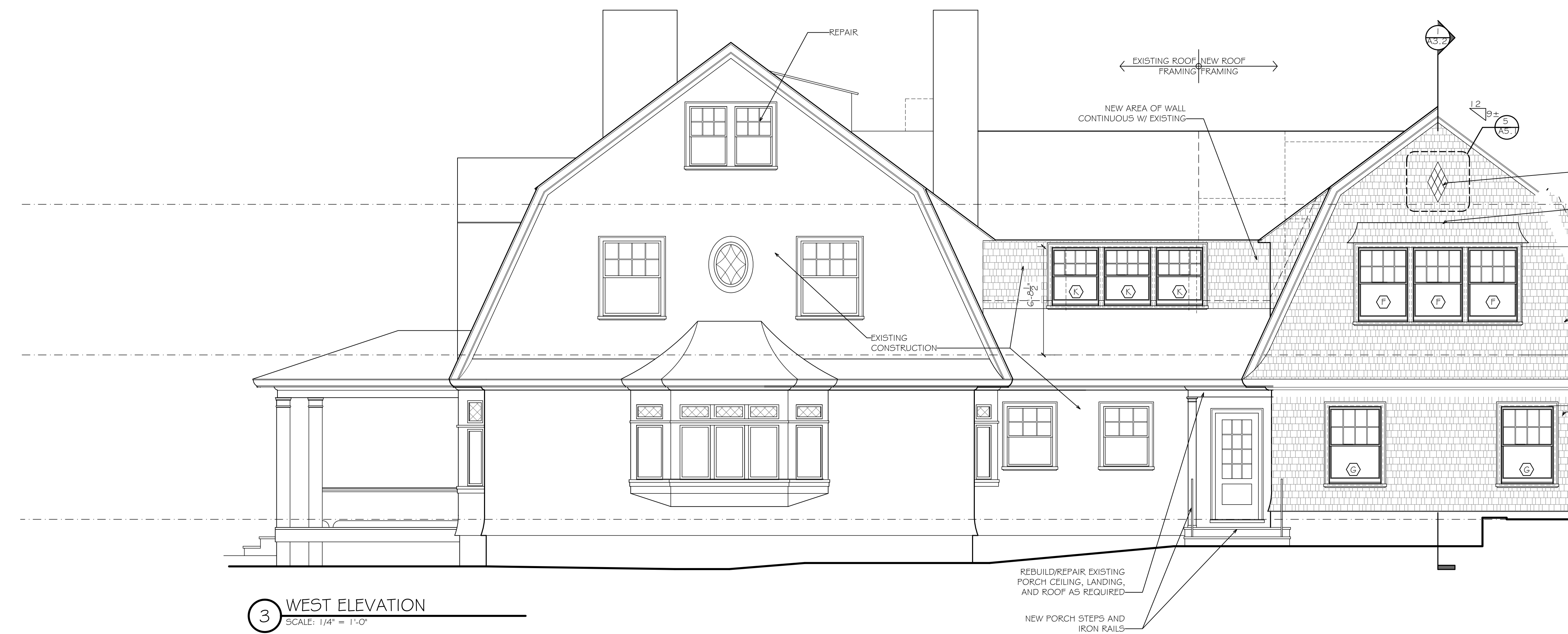
3 WEST ELEVATION SCALE: 1/4" = 1'-0"